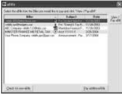
This screen shows the e-Bills outstanding in the customer's mailbox. Selecting any of them will cause the email to appear in the screen below.

up for that purpose. They also need a payment process that allows them to pay those bills (and any other paper bills) as they view them. Finally, they may need to be able to examine the bills they have paid.