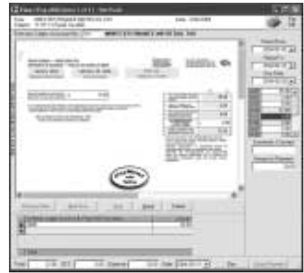
Payment of the invoice shown can be made from this screen. (In this case the invoice is a Manitoba Government PST return). If there are multiple bills from the same source, they will appear in chronological order. Once paid in full, the bill is stored in the "paid" file. Other capabilities include partial payments, accounting distribution, and other features.

To see a tangible example of how this process and technology can come to life, we will take a look at sample screens from TelPay(r) bill-payment